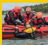
Oriskany & Sylvan Beach Water Rescue Teams Lake Water Rescue